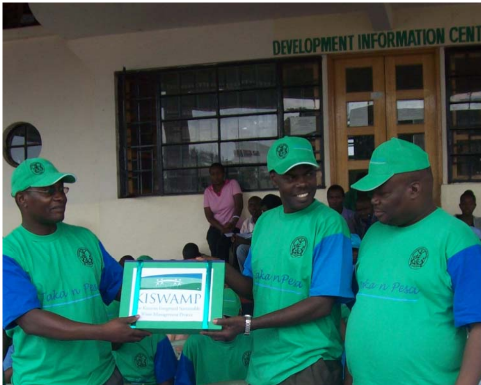
Presentation of the KISWAMP document to the Municipal Council of Kisumu by UN Habitat