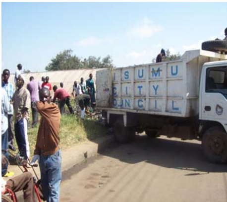
Garbage collection in Kisumu