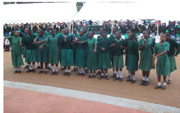
School children entertain guests during the colorful function in Kisumu