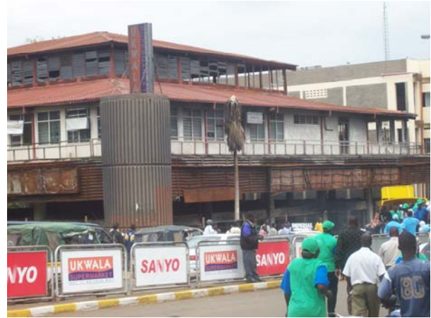
Procession passes one of the most buildings worst affected by the post election violence in Kisumu