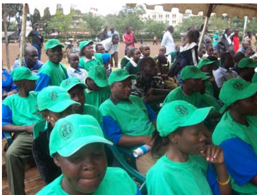
Community members listen to delegates' speeches from the