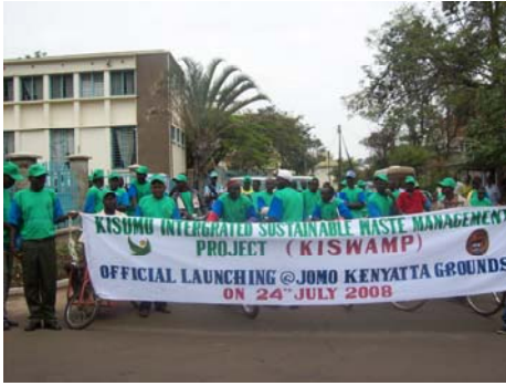
Procession from the municipal council of Kisumu offices to Jomo Kenyatta sports ground for official launch