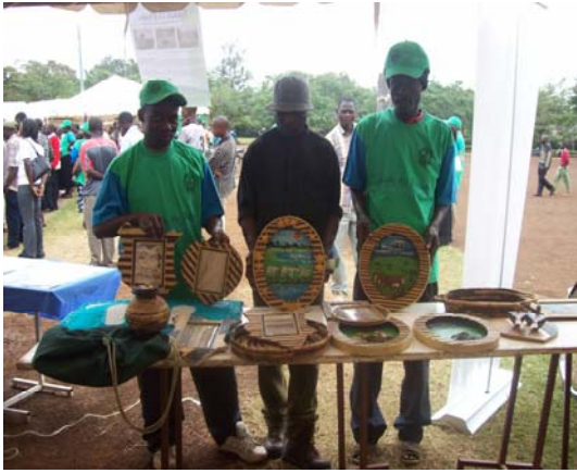
Wigwa group from nyalenda display their goods made from waste and banana leaves